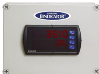
PRD1000 in NEMA 4X Enclosure

MSZ EN 60079-0:2013 MSZ EN 60079-0:2013/A11:2014 MSZ EN 60079-11:2012